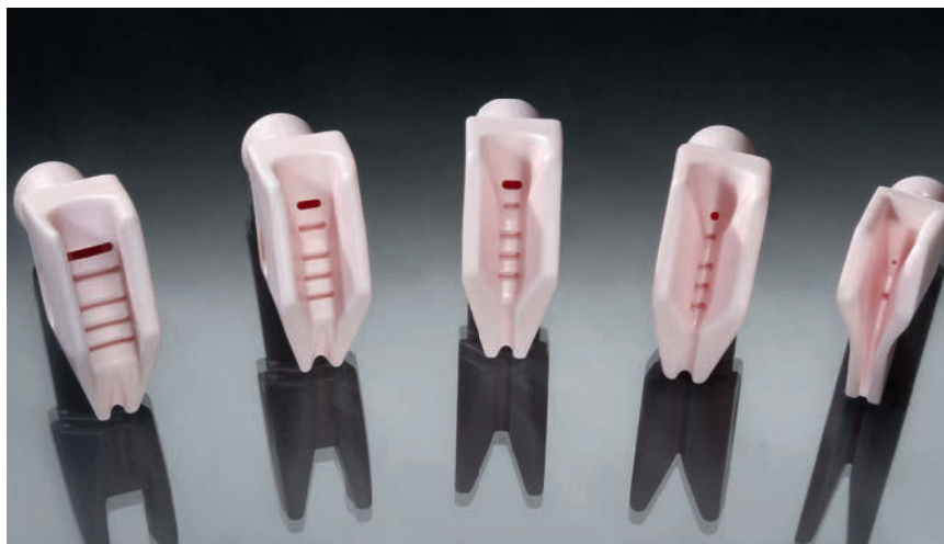
Standard range Rapal 200

Applicators for higher denier and BCF yarns are available on request. In addition and to complement its extensive range of standard applicators, Rauschert also offers the flexibility of CNC manufacturing to fabricate applicators with additional features, for example, additional/fewer dimples (1-5 dimples), a wider yarn channel (0.5mm–4mm width) or bigger/smaller oil hole (0.5mm–2mm diameter). Applicators can therefore be made according to customers requirements.